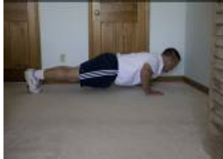
Push Up from Feet