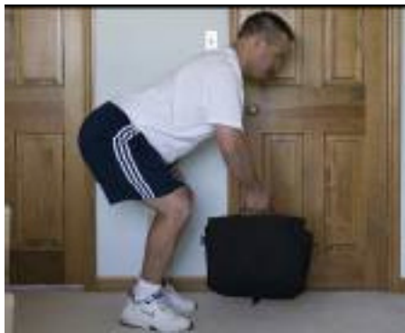
Bent Over Row