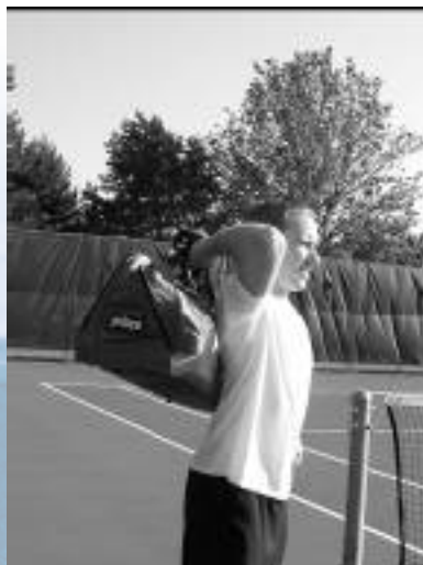
Tricep Overhead Press