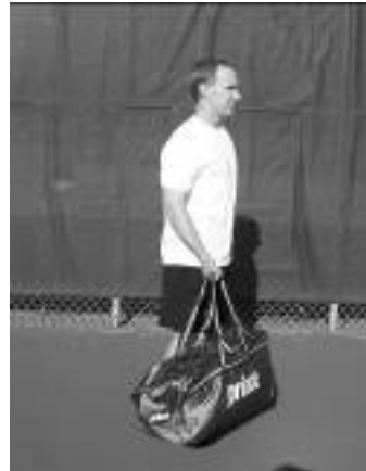
Standing Bicep Curl