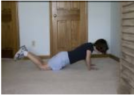
Push Up from Knees